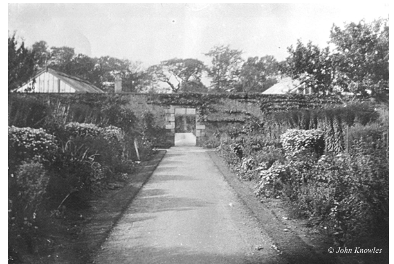
The walled garden at Lathom House - taken from the Visitor’s Book of the 2nd Earl